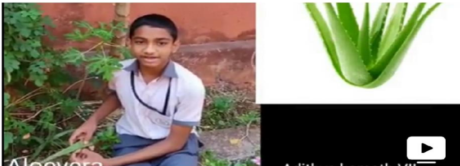
Identifying the medicinal plants on National Science Day