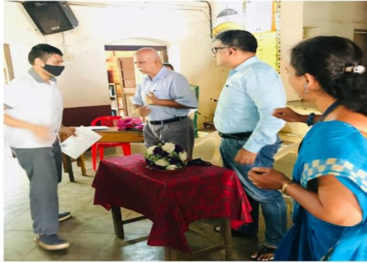
Hall Tickets issued to class X students 21-03-2022