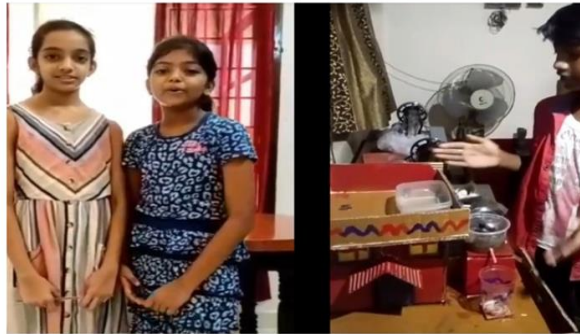
Conservation of water 31-07-2021