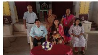
SSLC Topper felicitated during PTA meeting on June 1st