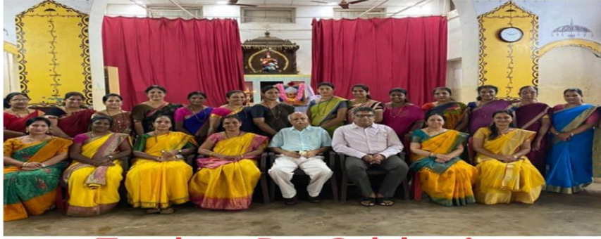
Teachers Day Celebration 05-09-2021