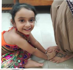
Guru Purnima 24-07-2021