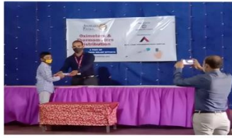
Distribution of medical kit by ISKCON 23-08-2021