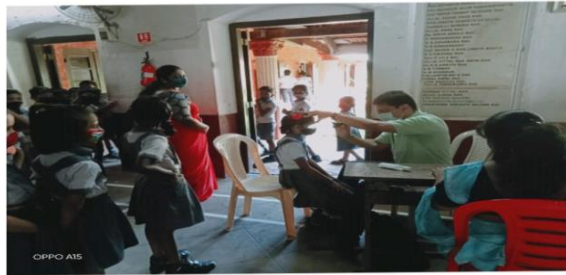
Medical Checkup 03-12-2021