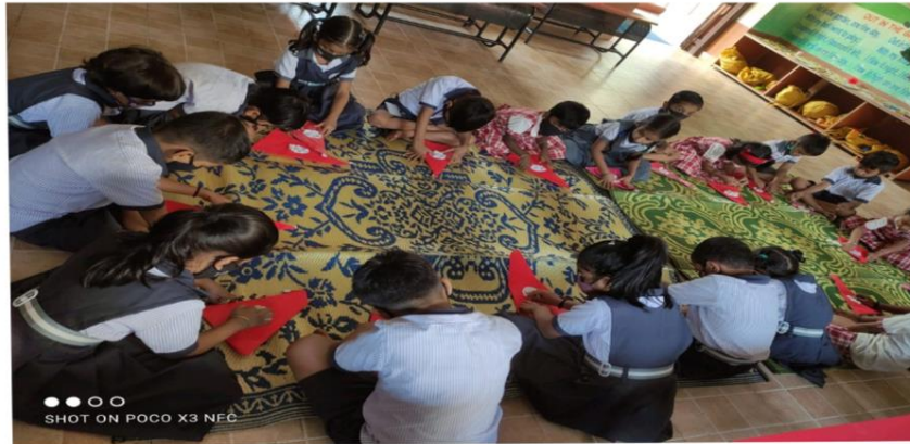
Christmas-Red day celebration by KG section 24-12-2021