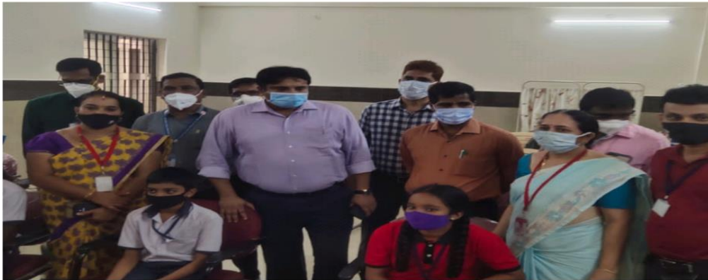
Vaccination Drive at Wenlock Hospital for 12-13 years students 16-03-2022