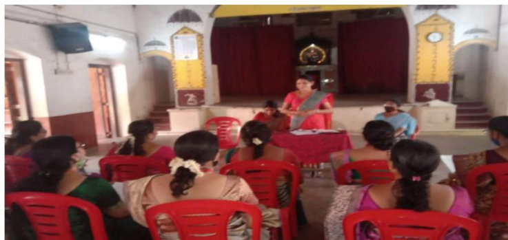
SSLC Exam Training 25-03-2022