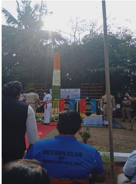
Kargil Vijay Diwas 16-12-2021