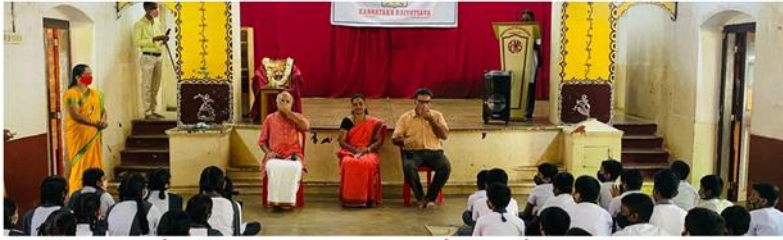
Kannada Rajyotsava and Rashtra Gayana