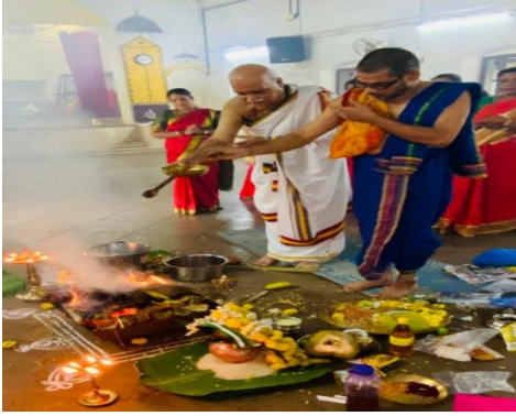
Sharada Pooja 12-10-2021