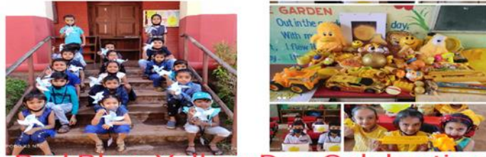
Red, Blue, Yellow Day Celebration